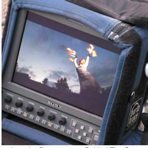
JumpJet Documentary Behind The Scenes

This TV show was not to be just about the end result but actually document the weeks that we spend in the shop fabricating and testing our machines. The forty to fifty hours of rehearsal time that the performers spend learning the choreography and perfecting the live performance aspects. The specialized training for the stunts and all the logistics involved in getting one of these large-scale outdoor spectacles, literally, off the ground.