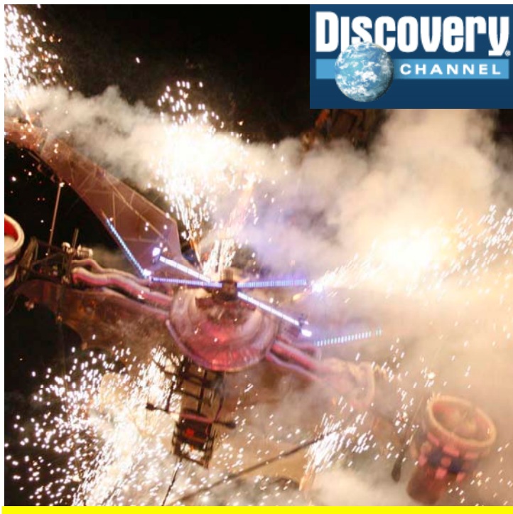
JUMPJET GETS A MAKEOVER & A TV SHOW

Our show is just part of the festivities that start at noon so be sure to come early in order to take it all in. Go to the <u>Winter Magic web site</u> for more details.