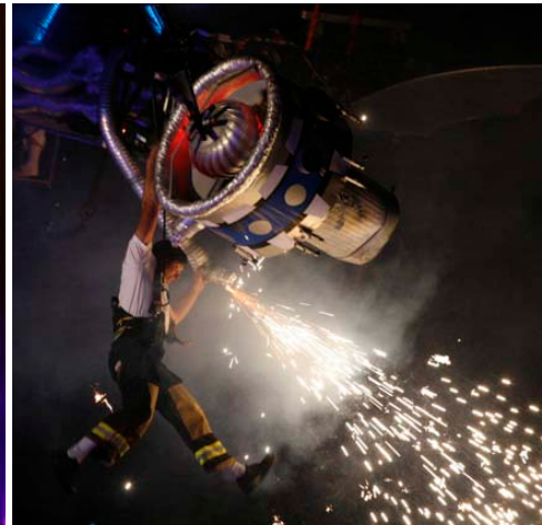
JUMPJET AT THE EXHIBITION - GALLERY