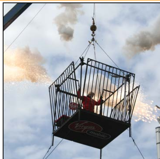
Sir Richard Branson Explodes from His Cell