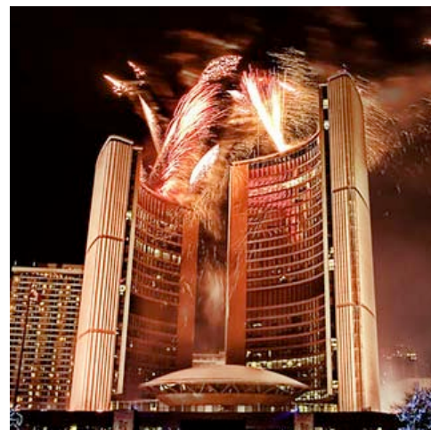
Toronto City Hall

For more a gallery from this show click HERE .