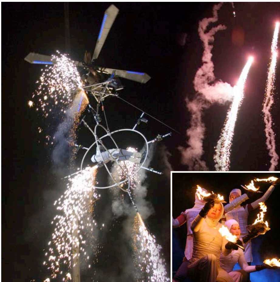
Gyro-Copter &amp; Pyro Finale

We have a brand new outdoor spectacle show for 2007 and it is called the Aviator. This is our homage to Mad Max and the gyro pilot character from our favorite movie. It is the story of our gyro captain's journey through post apocalyptic life. His quest for fuel, friendship and his interactions with the spirit world after his spectacular fiery crash behind the stage. Script and dialogue plays a big role in this performance as we add actors to our usual lineup of dancers, aerialists, circus, stunt and fire performers.