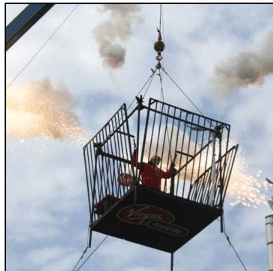
Sir Richard Branson Explodes from His Cell