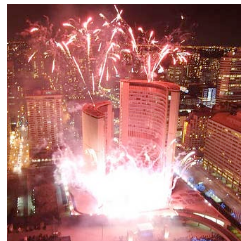
Cavalcade of Lights

Come and visit us at www.circusorange.com !!!