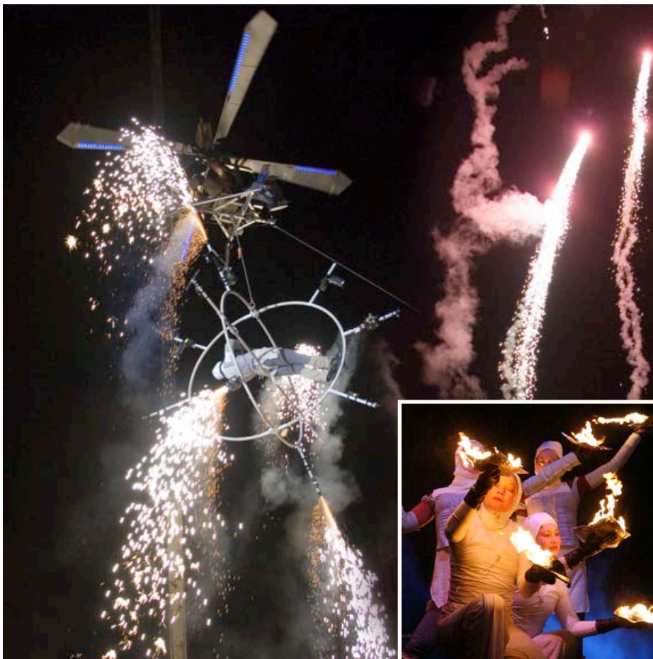
Gyro-Copter & Pyro Finale

We have a brand new outdoor spectacle show for 2007 and it is called the Aviator. This is our homage to Mad Max and the gyro pilot character from our favorite movie. It is the story of our gyro captain's journey through post apocalyptic life. His quest for fuel, friendship and his interactions with the spirit world after his spectacular fiery crash behind the stage. Script and dialogue plays a big role in this performance as we add actors to our usual lineup of dancers, aerialists, circus, stunt and fire performers.